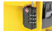
TSA approved padlock